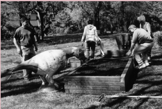
Volunteers of the Organic Garden project receive close supervision from The Wellness Community "Hope-a-saurus".